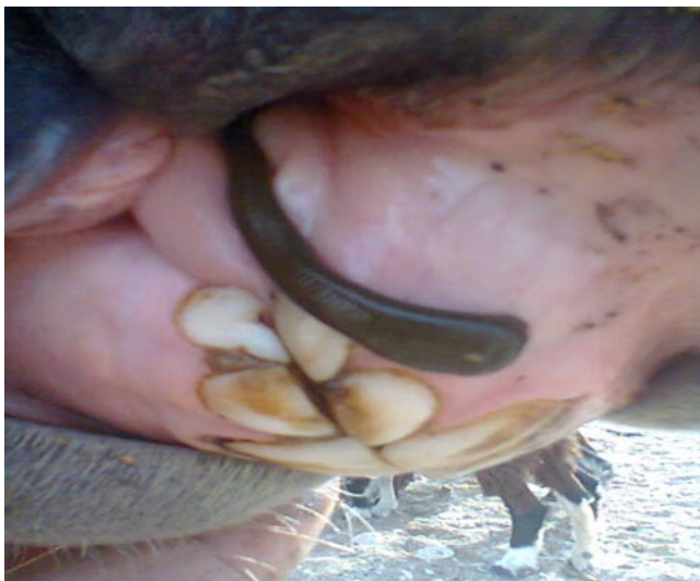
Figure 1. Attached L. nilotica to oral cavity of the 3-year old jackass.

In November 2013, a 3-year old jackass from Sangarnader village in Dehloran county, Ilam province, was infested by a number of leeches in his oral cavity upper gum. After examination and observation of the oral cavity, a leech with dark green and orange lines in lateral was determined. After removal of leech from the gum by rubbing dirt on the position, it was identified as L. nilotica (Figure 1). The strong jaws and muscular suckers at the anterior and posterior ends were observed. The leech had dark-green color surface with rows of green spots on the dorsal surface, and yellowish-orange and dark-green bands on either side with a 100 mm length, which was identified as L. nilotica species[13].