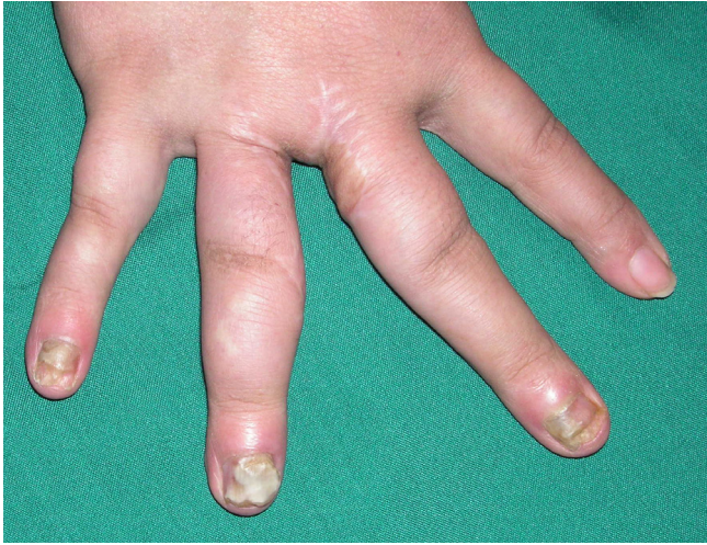
Figure 1. Nail dystrophy, onycholysis and onychorrhexis of middle, ring and little fingernails in the right hand four months after reconstruction of third web for syndactyly.

inflammatory cells and some vasodilatations. The clinical and histopathology findings were compatible with diagnosis of isolated nail psoriasis. Histopathologic sections show nail and skin tissue with psoriasis form accanthosis, heperkeratosis, elongated rete ridges, focal epidermal spongiosis, focal subepidermal vesicle formation, perivascular lymphocytic infiltration and fibrosis [Figures 2; 3].