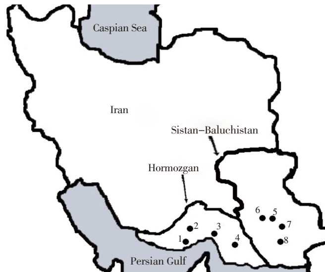
Figure 1. Map of Iran and location of Hormozgan and Sistan–Baluchistan Provinces.

Hormozgan and Sistan–Baluchistan provinces as the main malarious areas are located in southern part of Iran. These provinces are located in northern coast of Persian Gulf and Oman sea (Figure 1), where the weather is warm and humid enough for Anopheles species to be active throughout the year. This situation makes An. stephensi the main vector responsible for transmission of malaria to human in southern Iran.