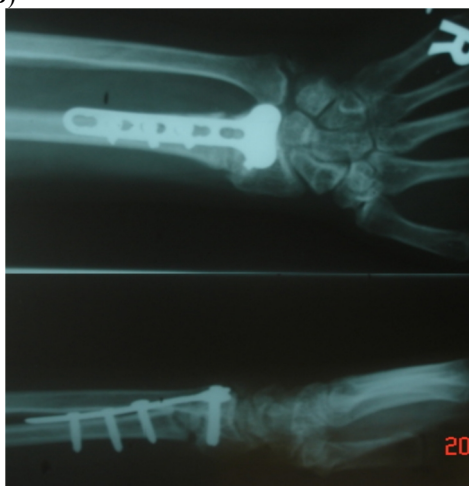
Fig. 2A and 2 B. The patient's; preoperative comparative, Radiographs (A) and postoperative radiographs (B).

previous distal radius fracture with severe malunion, for a period of around two years