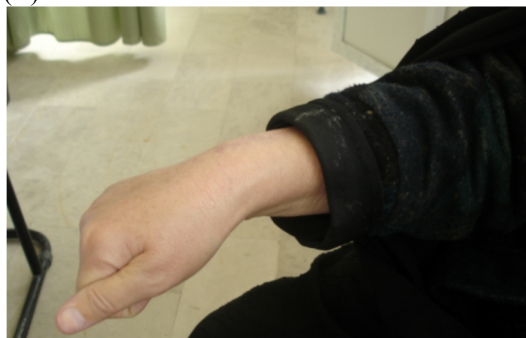
Fig. 4A and 4B. Clinical photo showed that functional improvement after operative treatment.