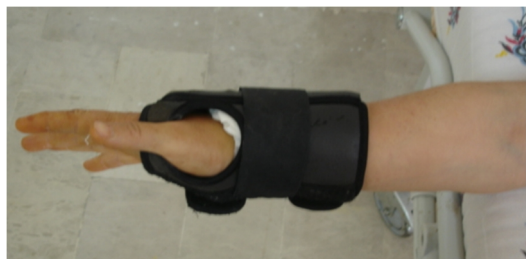
Fig. 3. After 4 weeks plaster slab removal, wrist splint was given for 2 weeks.