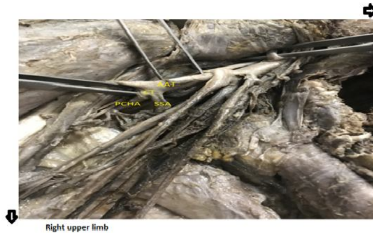
Fig 3. Showing the right axillary artery was giving a common trunk (CT) dividing into posterior circumflex humeral (PCHA) and subscapular (SSA) arteries.