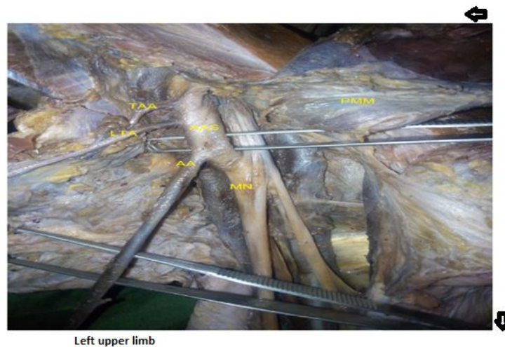
Fig 4: Demonstrating the; axillary artery (AAS), radial artery (RA), thoracoacromial artery (TAA), lateral thoracic artery (LTA), pectoralis minor muscle (PMM), and median nerve formation (MN).

arteries were traced and followed along with their courses. The further course of the radial artery, along the medial aspect of the arm first which was crossed to the lateral side, was superficial to the median nerve. Finally, it enters the cubital fossa close to the biceps brachii muscle tendon and then passes to some extent under the deep fascia to reach the roof of the cubital fossa. No communication had been noted with the brachial artery in this area. The left brachial artery crosses the cubital fossa and passes as an ulnar artery to the lower part of the upper limb. No vascular variation was observed in the forearm and hand regions.