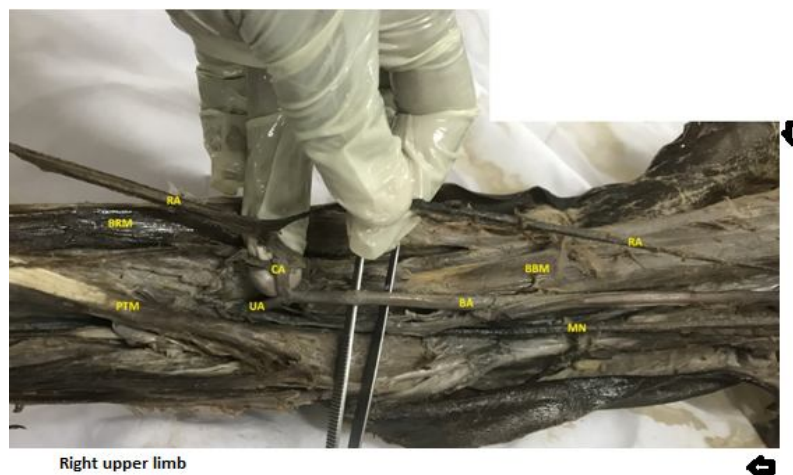
Fig 2. Demonstrating the; radial artery (RA), brachial artery (BA), ulnar artery (UA), communicating artery (CA), pronator teres muscle (PTM), biceps brachii muscle (BBM) and median nerve (MN).