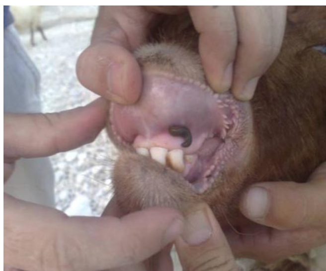
Figure 1. L. nilotica infestation in ram.

On physical examination, a black object was seen on internal mucous membrane of upper lip in ram (Figure 1) and lower lip in kid (Figure 2). They were attached by drinking water from a leech-infested spring.